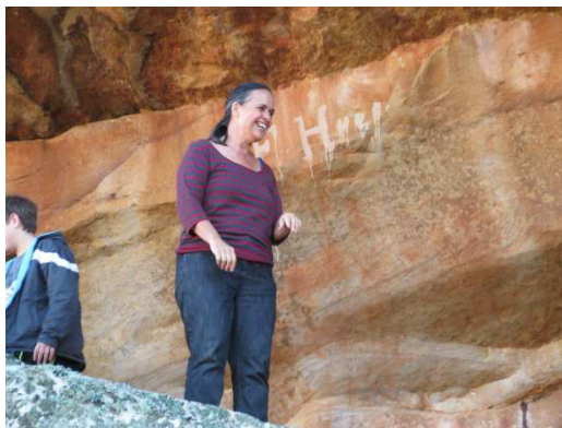
A large south-facing overhang