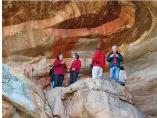
Our model posing for us

A new bushman painting site (at least for me) at Jakhals Nest in the Droëehoek area